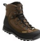
SUMMIT GTX 7900-3900