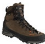
BRIKSDAL GTX 2275-4200