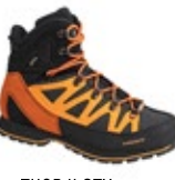
THOR II GTX 8375-9907