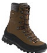
GUIDE NON GTX 4220-4203