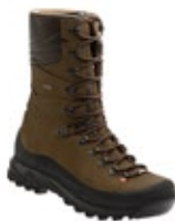
HUNTER GTX 4400-4203