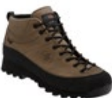
MONACO GTX 5600-4500