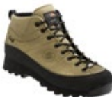
MONACO GTX 5600-2300