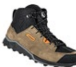
ATTIVA MID GTX 2320-4207 NEW