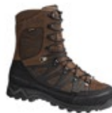
IDAHO II GTX 4530-4204