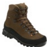
NEVADA NON GTX 5860-4203