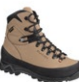
SKARVEN EVO GTX 7325-3166