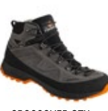
CROSSOVER GTX 2821-6007