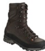
WILD ROCK PLUS GTX 9420-4000