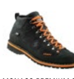
MONACO PREMIUM GTX 5710-9907 NEW