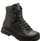
NEVADA BLACK GTX 5840-9900