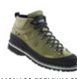
MONACO PREMIUM GTX 5710-2300