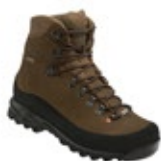
NEVADA LEGEND GTX 5845-4203