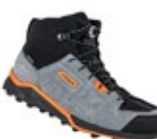
ATTIVA MID GTX 2320-6007 NEW