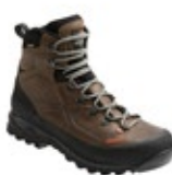
VALDRES GTX 9279-4360