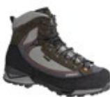
COLORADO GTX 2680-2863