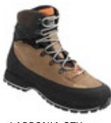
LAPPONIA GTX 4952-4500