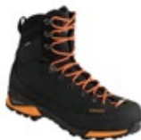
BRIKSDAL SF GTX 2278-9907