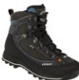
SUMMIT GTX 7900-6052