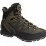
THOR II GTX 8375-2899