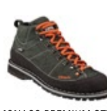
MONACO PREMIUM GTX 5710-6600