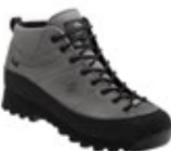
MONACO GTX 5600-6000