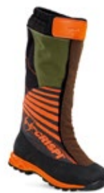
HIGHLAND PRO 4340-9900