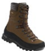
GUIDE GTX 4200-4203