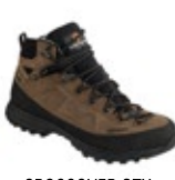
CROSSOVER GTX 2821-3900