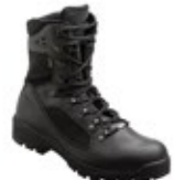
OASI GTX 6010-9900