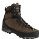
BRIKSDAL NON GTX 2265-4200