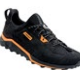
ATTIVA 1910-9900 NEW