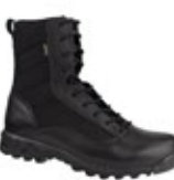
SNIPER GTX 7820-9900