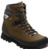
SKARVEN II GTX 7330-4203