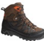
WYOMING II GTX 9520-4200