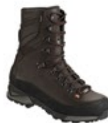
WILD ROCK GTX 9410-4000